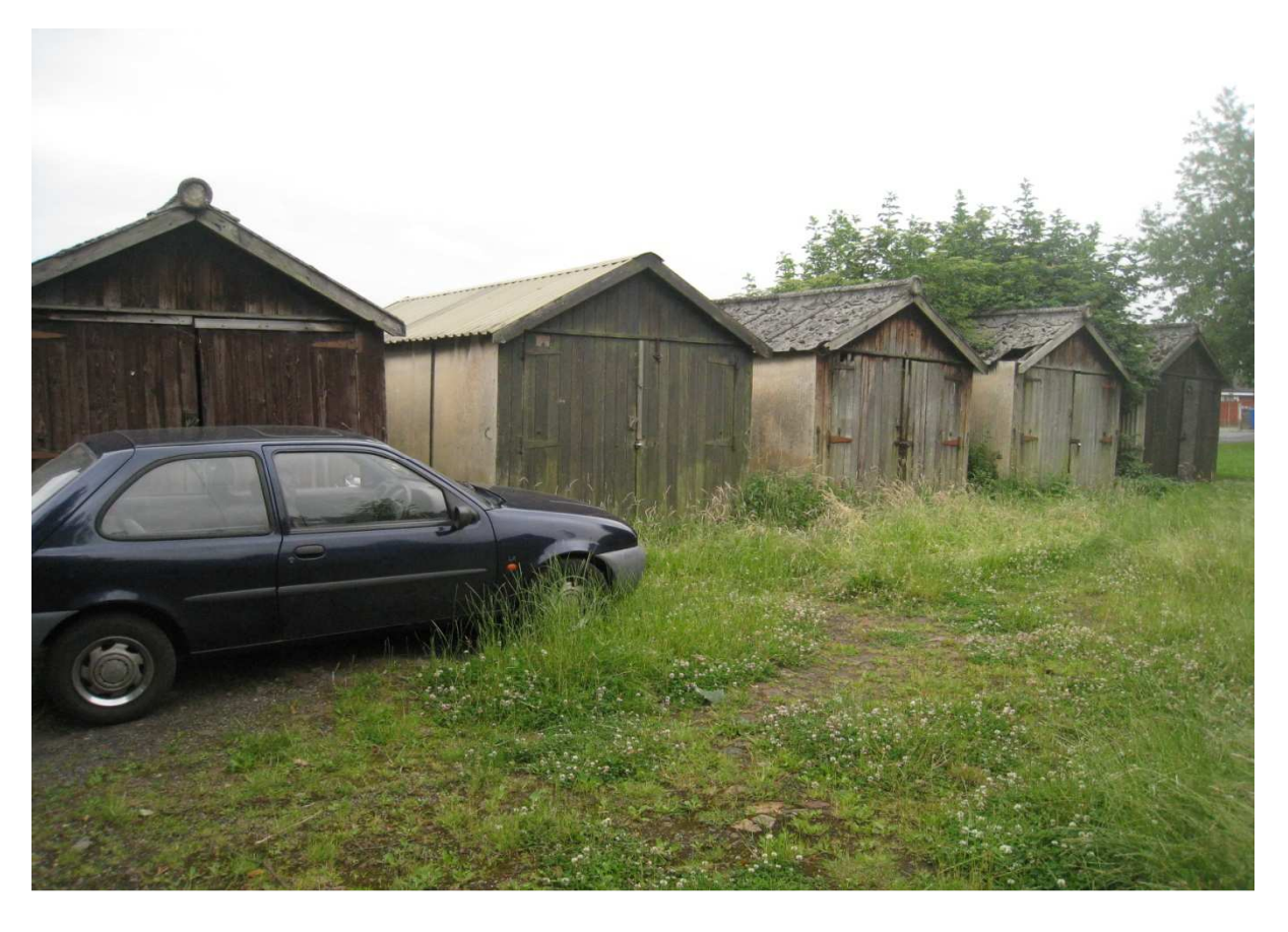
Overgrown entrances to garages indicate these may not be being used to store vehicles