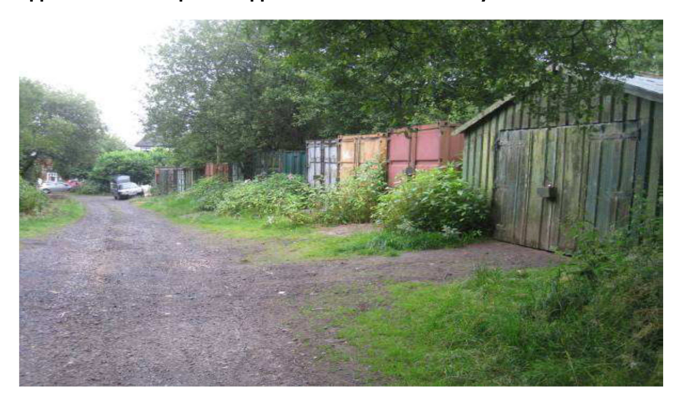
Overgrown entrances to garages indicate these may not be being used to store vehicles