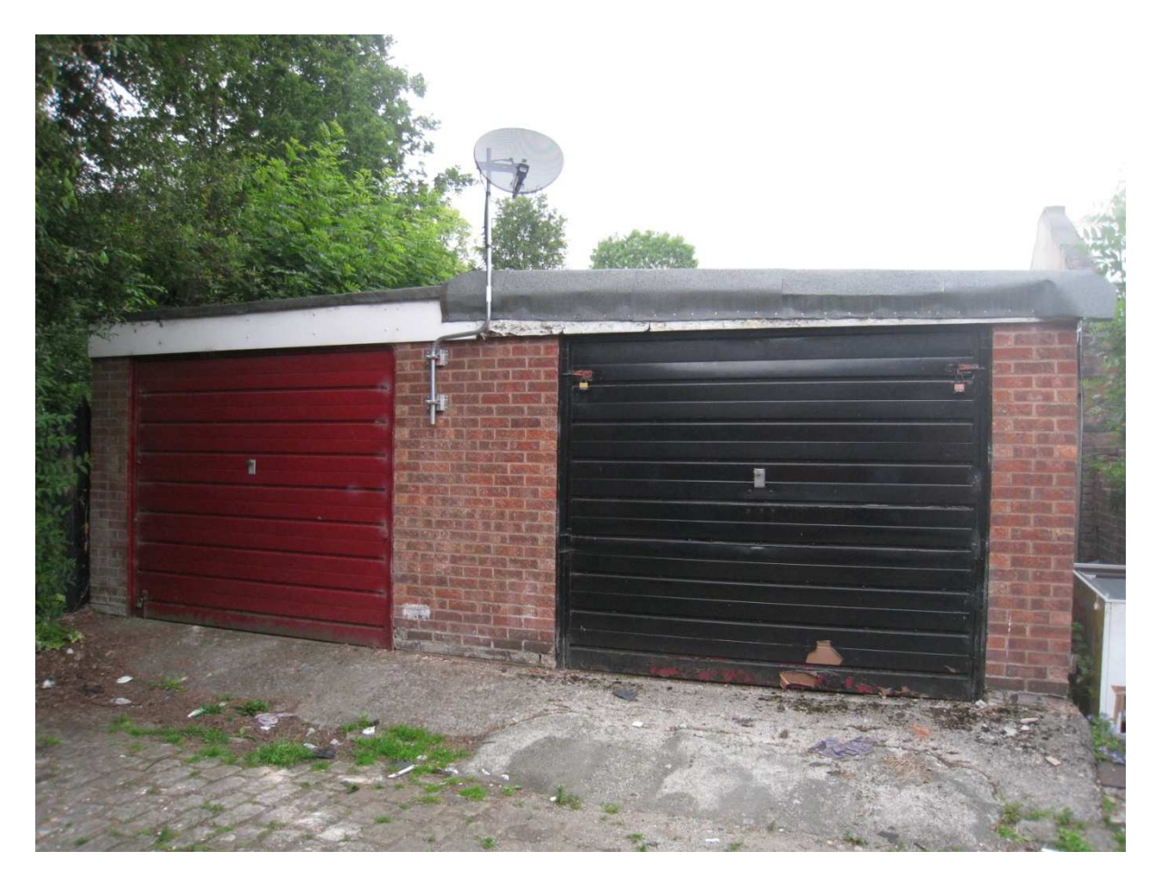
Satellite dish on roof of garage